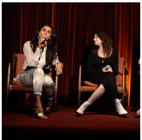
THE SEX TECH SHOWCASE AT SOHO HOUSE LA TECH WEEK