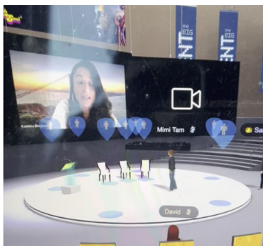
6G WORLD CONFERENCE THE FUTURE OF SEX AND DATING